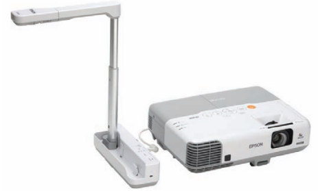
Share 3D objects using the ELP-DC06 document camera